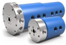
STANDARD ROTARY UNIONS