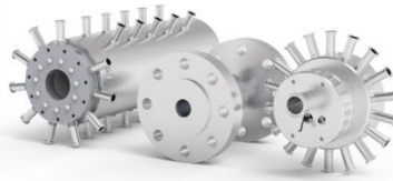
CUSTOM ROTARY UNIONS